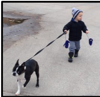
Johnny and his human brother going for a walk.

Johnny started his adoption trial on the Saturday of the Pet Valu Thanks for Giving Adoption Event. He was scared and timid at first, but after a month of being loved up and going on play dates with a fellow foster brother who was adopted by another family in the same town. Johnny has come through and has become the perfect little guy.