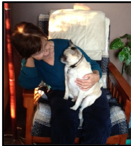
Here is Jolene sitting with her new mom.

Since our last Newsletter, we have had a few adoptions and a few dogs on Adoption Trials. Jolene has found a wonderful family to call her own. They could not be happier and she is truly a great addition to their family. Way to go Jolene!!!