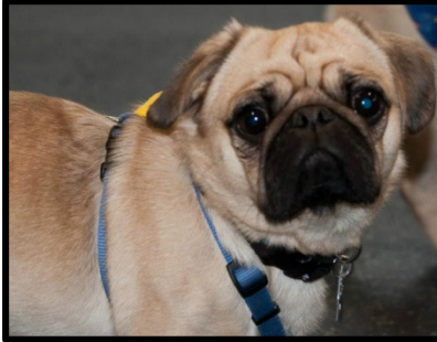
Bowser had a fun time learning to socialize with other dogs and humans at the Howl-o-ween Party!