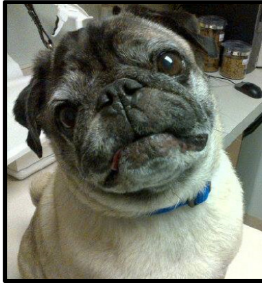
Eddy has such a comical face. He makes you smile just looking at him.