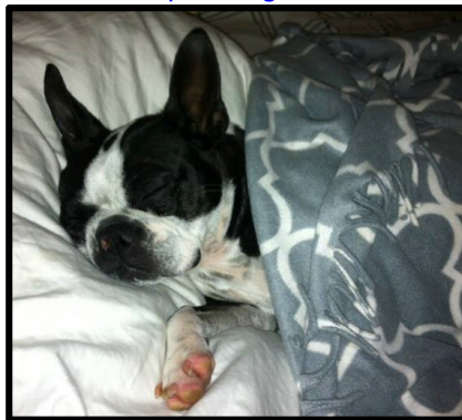
Rain is catching some Zzzz's in the early morning, while her foster mom gets ready for work.

Rain the Boston Terrier is all healed up from her surgeries and is now waiting to find her Forever Family. She has been working on her socialization with new dogs and new situations. Rain is also working on her housetraining and has almost mastered it. She will need a home that will be patient with her and help her learn what it's like to be a family pet and not to breed anymore. If you are interested in meeting Rain or know someone who is, please email us at btpmb@gmail.com