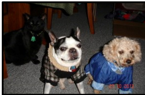
Benny with his brothers Toby and Sam (the black cat) Missing from Photo: Jumbo the other cat.

Benny also found his forever family. Ben's new mom first saw Ben, when one of our foster families showed them a photo of Benny in his jammies. It wasn't long after we got an email from the family applying to adopt him. Ben did great on his adoption trial and they made his adoption official a few weeks ago. Yay Benny!!