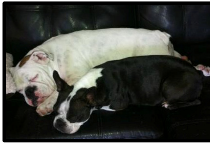
Rain cuddling with her foster sister Bella. These two are best buddies.

Rain the Boston Terrier is all healed up from her surgeries and is now waiting to find her Forever Family. She has been working on her socialization with new dogs and new situations. Rain is also working on her housetraining and has almost mastered it. She will need a home that will be patient with her and help her learn what it's like to be a family pet and not to breed anymore. We have recently learned that Rain likes to groom cats. First she chases them, then once she has a chance she will lick and clean them. If you are interested in meeting Rain or know someone who is, please email us at btprmb@gmail.com