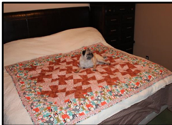
Caspar enjoys his new blanket on the bed!