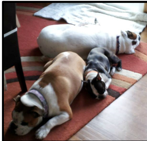
Tillman, Chip and Milo soaking up the sunshine on a cold day

Chip the Boston Terrier adoption was also completed at the end of November. He now has two big brothers name Tillman and Milo and all three boys love playing together and going for walks. Congratulations Chip, you have come such a long way!