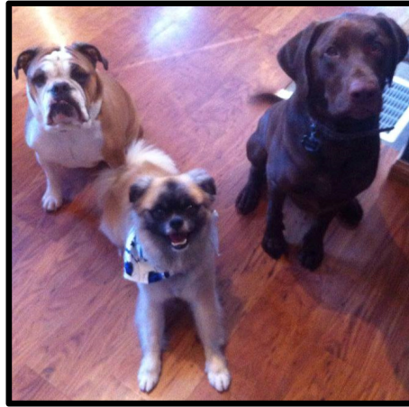
Chewy (middle) with his foster siblings Peanut (left) and Remi (right)

One of the new dogs who came into care since our last newsletter was Chewy the Pug X. Chewy came to us all the way from Rankin Inlet, NU. It is believed Chewy is possibly crossed with American Eskimo. Chewy is going on an adoption home visit this Saturday, January 11 th . Fingers crossed Chewy!!