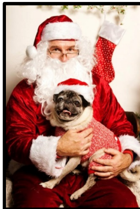
Eddy told Santa that he wanted a family of his own for Christmas.

Eddy the Pug is also still waiting for his forever family. Eddy came into the rescue with his sister Maggie and would really like to find his forever family too. Eddy has come a long way with his training since coming into our care. Both Eddy and Maggie went through some extensive vetting to get them healthy. We have recently found out that Eddy has crystals in his urine. We are taking him for an x-ray this coming weekend to see if he has stones that will need to be removed. The crystals in his urine would have contributed to Eddy's housetraining issues. And we have started him on a new food that is supplied by the vet clinic. It helps break up the crystals in Eddy's urine and we should see a difference in his frequent urination soon. Eddy has a few interesting quirks that make him unique, but if you already know what pugs are like, this may not surprise you. If you are interested in meeting Eddy or know someone who is, please email us at btprmb@gmail.com