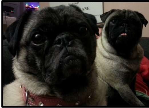
Hooch and Maggie sitting pretty for a picture

Completed adoptions include Maggie (now known as Hooch). Hooch has a pug sister named Maggie who is also a BTPRSM alumni. Congratulations to Hooch on finding the perfect family!