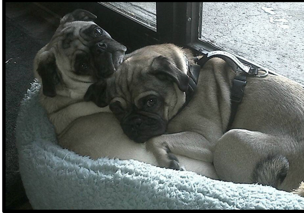
Brody and Lily snuggling in the dog bed

Cookie (now known as Lily) also finalized her adoption into her new forever family. Lily now has a brother named Brody who she loves more than anything. She gets to go to her mom's store every day and greet customers when they arrive. Congratulations Lily!