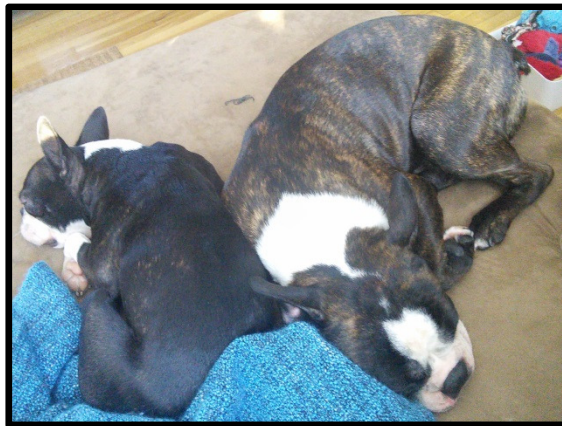
Maya and Wilbur take an afternoon nap after playing for hours

Maya the Boston Terrier came back to the rescue's care at the end of November. Unfortunately it wasn't working out in her home and the family had to surrender her back. Maya is such a little jumping bean. She loves to play with her toys and especially her toy balls. She can fetch for hours. We took Maya on a few adoption home visits but it wasn't until the third visit that we found a perfect match! Maya is going to be adopted by a wonderful young family who have a male Boston Terrier named Wilbur. We will be finalizing her adoption in the next few weeks. Congratulations Maya!!!